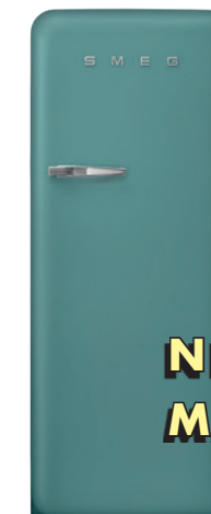
Emerald Green FAB28RDEG3