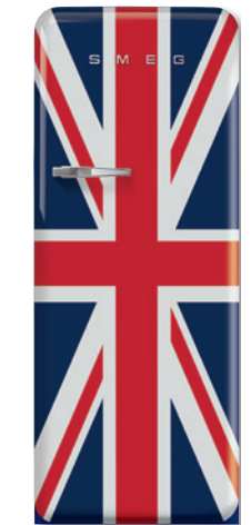
Union Jack FAB28RUJ3