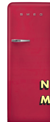
Ruby Red FAB28RDRB3