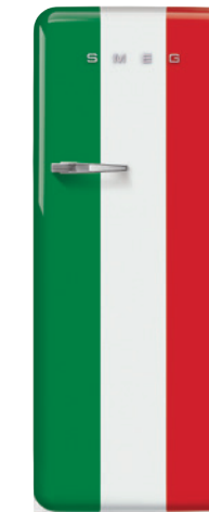
Italian flag FAB28RIT3