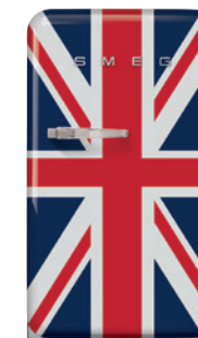
Union Jack FAB1ORDUJ2